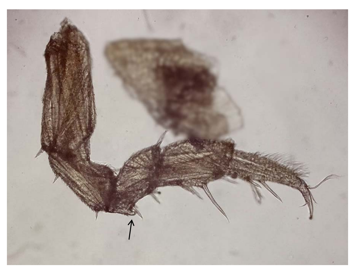
Figure 2 : Trichoniscoides sarsi male pereiopod 7. Specimen collected from Clevedon. Note prominent hooked spur at base of merus (arrowed).

Additionally, FA collected a specimen of a small, red-eyed, trichoniscid woodlouse from within clayey topsoil on an allotment in Horfield, Bristol (ST600763, VC34) on 06.xi.2020. The specimen was forwarded to SJG for determination and confirmed as male T. sarsi . Other species found on the same allotment plot were Metatrichoniscoides celticus Oliver & Trew (the first English record; Ashwood & Gregory, 2021), Platyarthrus hoffmannseggii Brandt, Armadillidium nasatum Budde-Lund, Oniscus asellus L., Porcellio scaber Latreille and Philoscia muscorum (Scopoli). All specimens of T. sarsi have been retained in the personal collection of FA, and record details have been submitted to the BMIG Non-marine Isopod Recording Scheme via iRecord ( www.brc.ac.uk/irecord ).