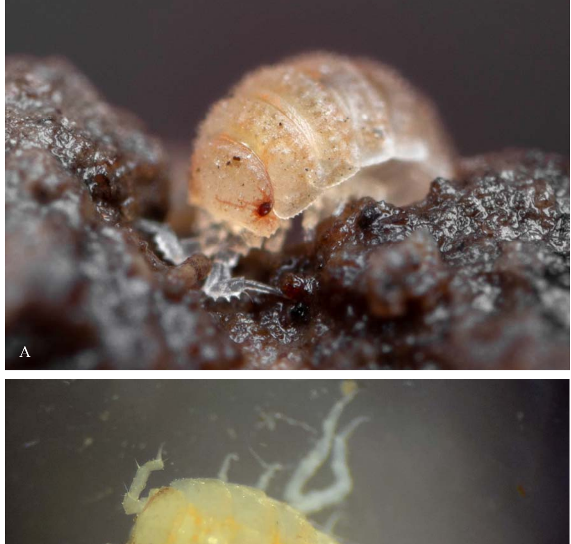
B Figure 1: Trichaniscoidas sarsi female specimen from Clevedon