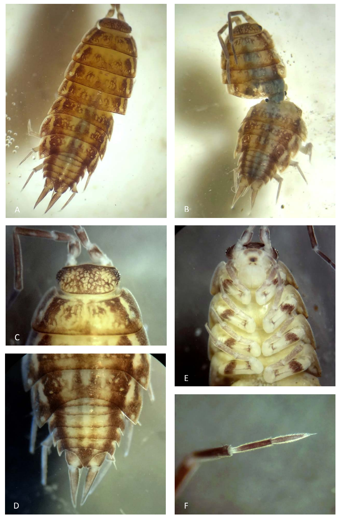
Figure 2: Porcellionides sexfasciatus female, specimens collected from Eden Project in 2020. A) & B) Two different preserved specimens; C) Cephalon and pereionite 1; D) Pereionite 7, pleon, telson and uropods; E) Ventral view, showing characteristic darkly pigmented bands on basis of pereiopods; F) Antennal flagellum (images C-F are of specimen shown in 2A).