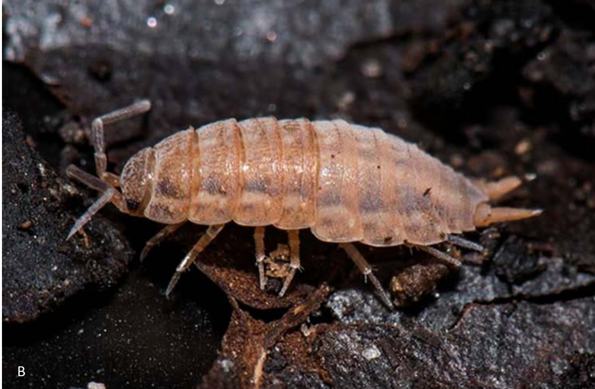
Figure 1: Two live specimens of Porcellionides sexfasciatus observed at Eden Project in 2018. A) Male (with re-generated right antenna) B) Female (recently moulted).