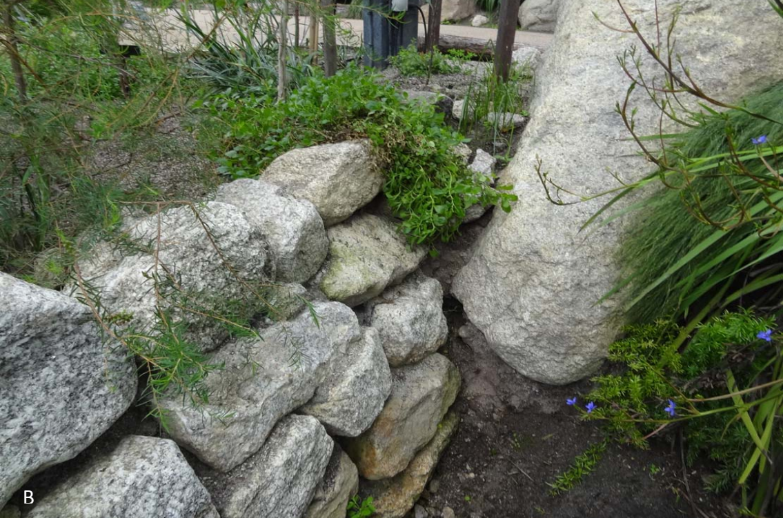
Figure 4: Locations where Porcellionides sexfasciatus were collected in March 2020. A) Mediterranean 'garden', under uppermost stone behind table; B) Western Australia 'garden', under stone at top of wall.