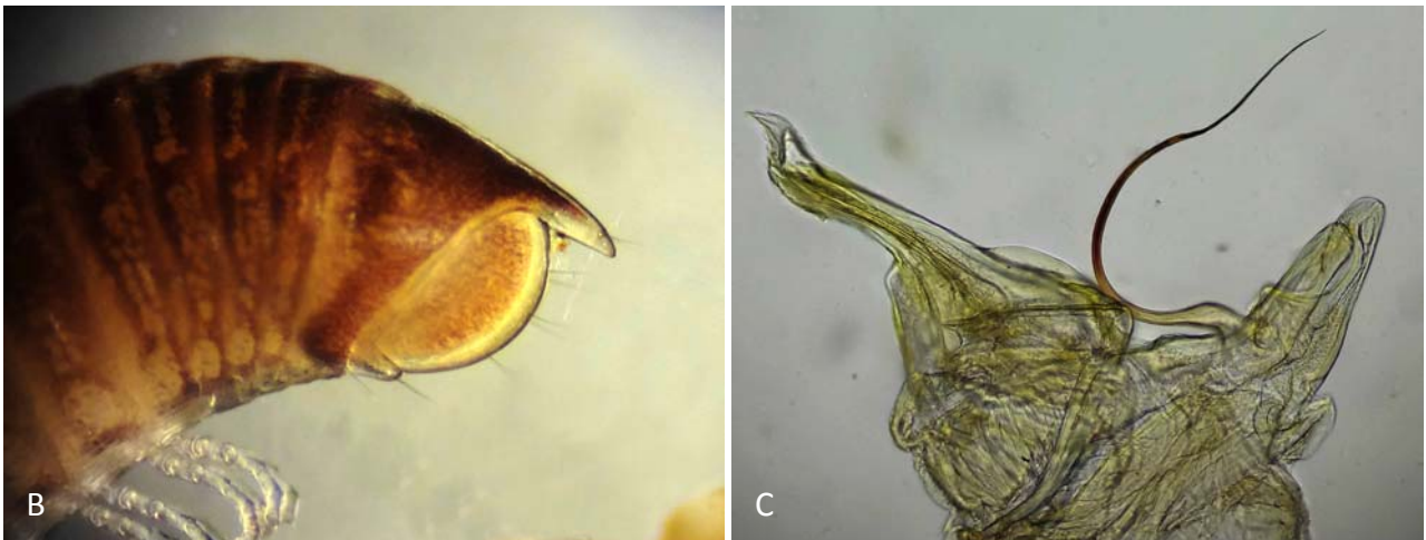
Figure 1: Cylindroiulus sagittarius from at Wyllie Wood, December 2017 A) Live female specimen, habitus; B) Male posterior body rings, showing apododous segments and projecting telson; C) Male gonopods (cleared in euparal), mesal view.